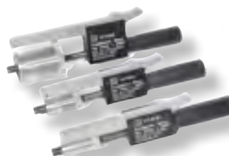
Mono Pipe Scraper