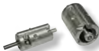
Turbo Pipe Scrapers