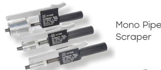
Mono Pipe Scraper