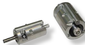
Turbo Pipe Scrapers